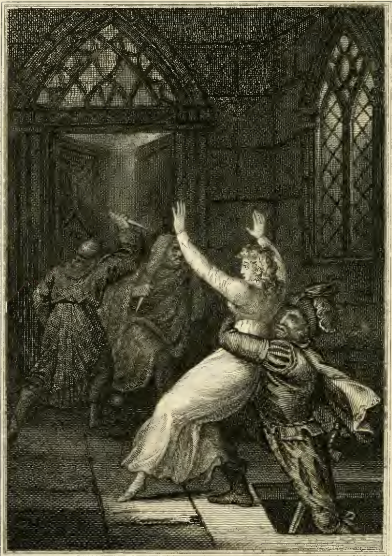
Engraved by Brocas junr